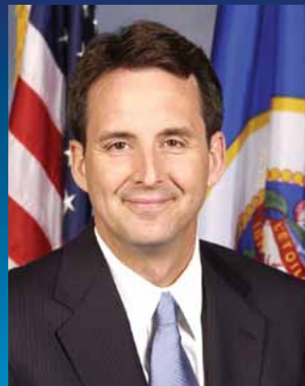
Minnesota Governor Tim Pawlenty ECS Chair 2008-10

“For 45 years, ECS has been a leader in state education policy and practice. Each year, the ECS National Forum on Education Policy brings together a wide range of education policymakers — governors, legislators, chief state school officers, higher education officials — to exchange ideas and hear from the country’s foremost education experts. Come be part of the conversation this year in Portland!”