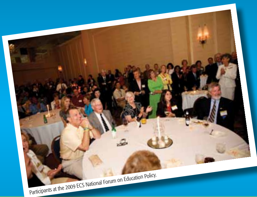
Participants at the 2009 ECS National Forum on Education Policy.

This year’s Forum will be held at the: Portland Marriott Downtown Waterfront Hotel