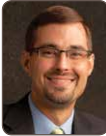
Brian Sandoval Governor, State of Nevada 2013-15 ECS Chair