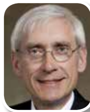
TONY EVERS @WISUPTONYEVERS

worked in school district- and state-level education policy in Nevada. He previously served as the senior advisor to Gov. Sandoval, providing general policy advice and serving as the governor's speech writer and spokesman. In this role, he was the governor's primary education policy advisor. His education policy experience also includes service with the Clark County School District, where he worked as the executive director of government affairs, public policy and strategic planning.