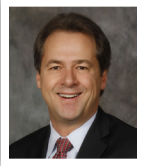
Steve Bullock Governor Montana