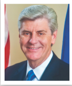
Phil Bryant Governor Mississippi